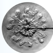
Spring water of good quality

The drop-picture method can tell us something about the quality of the water same being the essence of all life as well as foodstuff.