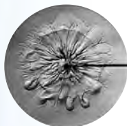
Tap water of moderate quality