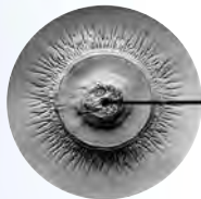
Undegraded laundry detergent in water